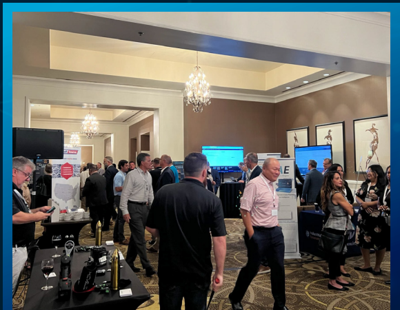
NETWORKING EVENT SPONSORSHIP

4,000 attendees at our last 5 webinars and outlooks 1,000 attendees at our last networking event